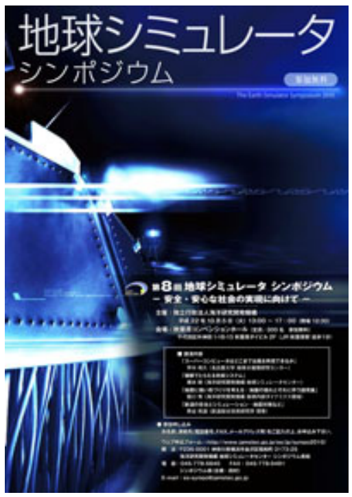
Leaflet (in Japanese)[PDF:432KB]