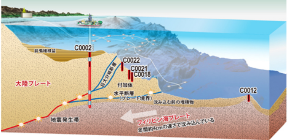
Figure 1 Drilling Sites

Investigation of sediments above seismogenic zone