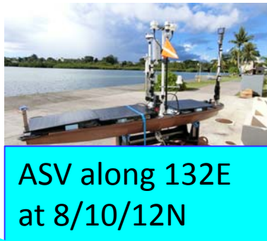
ASV along 132E at 8/10/12N