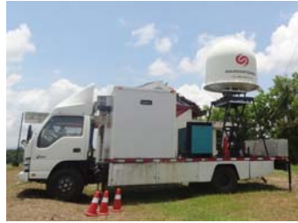
Radiosonde, X-band Radar, GPS & AWS at Laoag