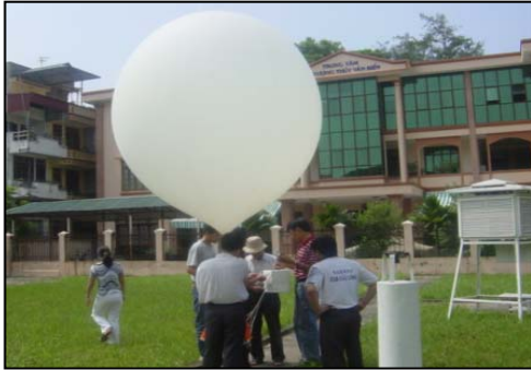
Simultaneous Ozone & Water vapor sondes at Hanoi , Ho Chi Minh and Kototabang