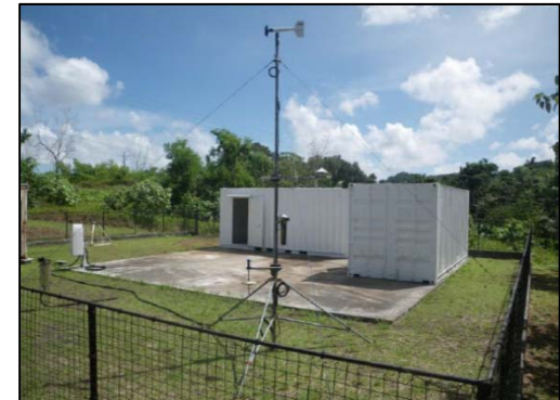
Radiosonde (4/day), Lidar & AWS at Palau .