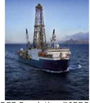
JOIDES Resolution

Compared to the deep-sea scientific drilling vessel, the Chikyu by JAMSTEC, the JOIDES Resolution is used more often for drilling in shallow waters.