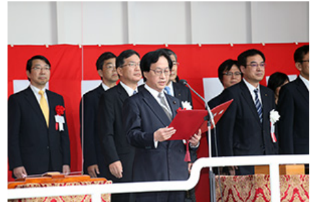
State Minister Fujii announced the name "KAIMEI".