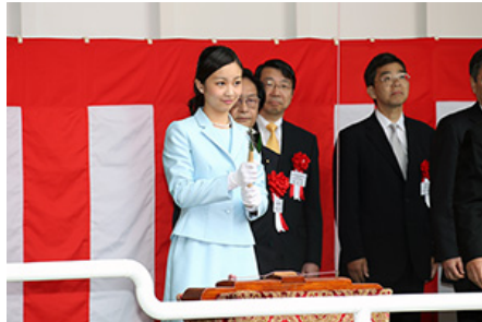
Her Imperial Highness Princess Kako cut the rope to launch R/V KAIMEI.

After final outfitting and sea trials, the research vessel is scheduled to be delivered at the end of fiscal year 2015, followed by crew training before it starts marine research and exploration.