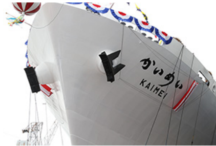
The letters of the vessel's Japanese name written by Minister Shimomura were drawn on the surface of its body.