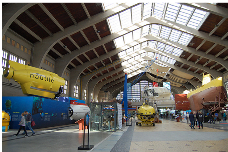
In the entrance hall "The Great Gallery of Men and Machines," the French bathyscaph Archimède (the large ship on the right) and other real and mock-up submersibles from around the world are on display.