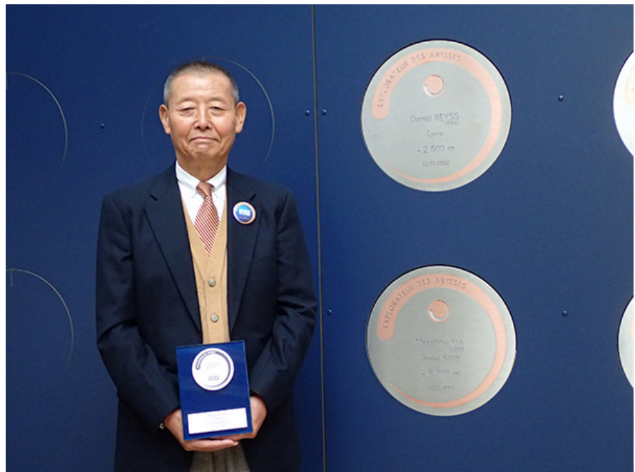
Each "Wall of Fame" plate includes the name of explorer, the name of submersible, the depth it reached, and the date of exploration.